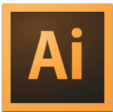
Adobe Illustrator 2020 .ai / .eps / .pdf