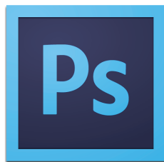
Adobe Photoshop 2020 .psd / .pdf / .tif / .jpg