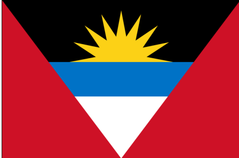
Where In The World