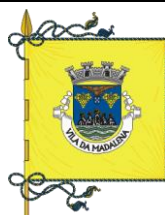
The Flag of the Municipality of Madalena (Pico)