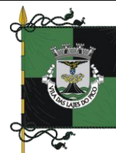
The Flag of the Municipality of Lages do Pico