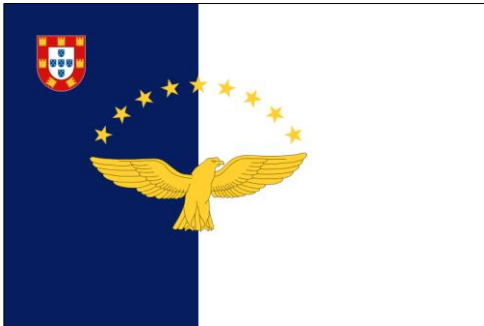
Where In The World