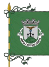
The Flag of the Municipality of Santa Cruz das Flores