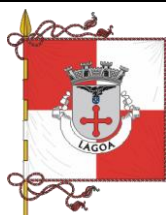
The Flag of the Municipality of Lagoa