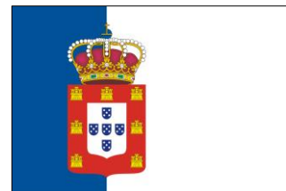
The Flag of Portugal (1830 – 1910)