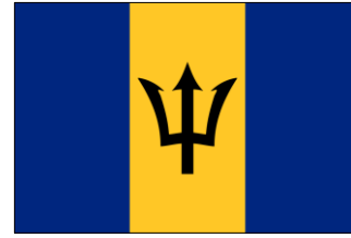
The Flag of Barbados (1966 to Present Day)