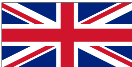
The Flag of the British Windward Islands (1833 to 1886)

In 1833 the British colony of Barbados joined the British Windward Islands, the Union Jack as the flag. In 1870 The Flag of the Colony of Barbados was a blue ensign with the emblem of Barbados in the centre right side of the flag. The emblem of Barbados featured Britannia in the sea. In 1885 Barbados left the British Windward Islands colony.