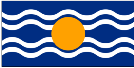
The Flag of the West Indies Federation (1958 to 1962)