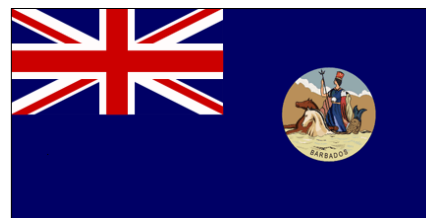
The Flag of the Colony of Barbados (1870 to 1966)

Between 1958 and 1962 Barbados was part of the West Indies Federation. The Flag of the West Indies Federation was a blue field featuring four undulating white lines with a golden circle on top. This design was to represent the sun shining on the Caribbean Sea.