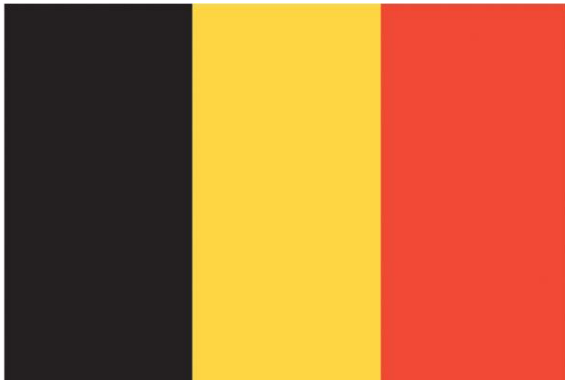
Where In The World