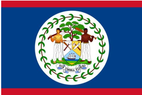
Where In The World