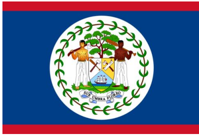
The Flag of Belize (1981 to Present Day)

Also a new Governor-General Flag was designed that is a simple blue flag with a lion on top of a crown with Belize underneath.