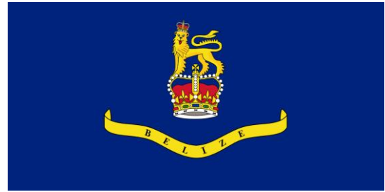
The Flag of the Governor-General of Belize (1981 to Present Day)