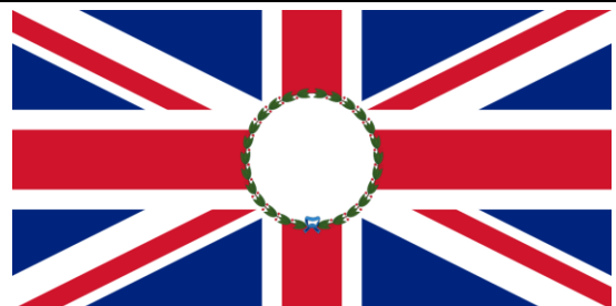
The flag of the Governor of British Honduras (1870 – 1981)