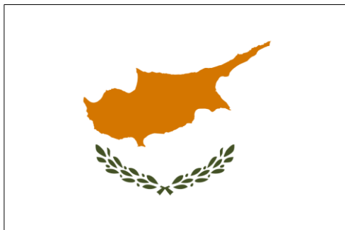
Where In The World