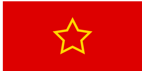
The Flag of Democratic Federal Macedonia/People's Republic of Macedonia (1944-1946)

In 1946 it became one of the six republics of the Socialist Federal Republic of Yugoslavia after loosing its independence. The name of the country was changed to the Socialist Republic of Macedonia and it kept the plain red flag with a smaller outline of a gold star.