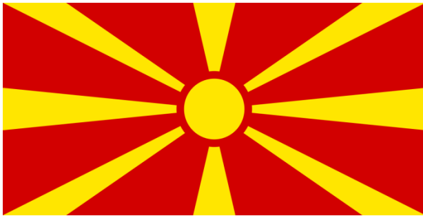
Where In The World