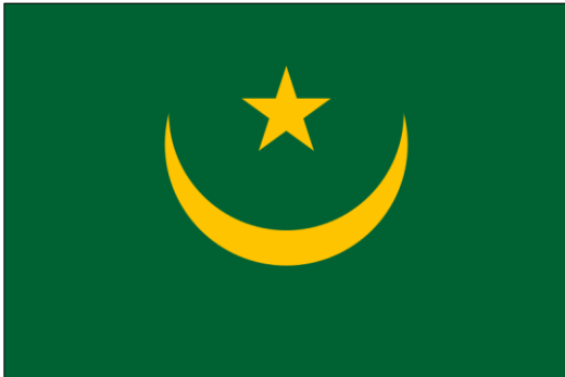
Where In The World