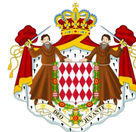
The Coat of Arms of Monaco

The colours on the shield, red and white in a pattern known as 'lozenge argent and gules' in heraldic terms, are the national colours. A flag bearing only the red and white lozenge pattern has been commonly used throughout Monaco's history to represent the Grimaldi family, and by extension, the country.