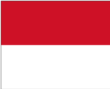
Where In The World