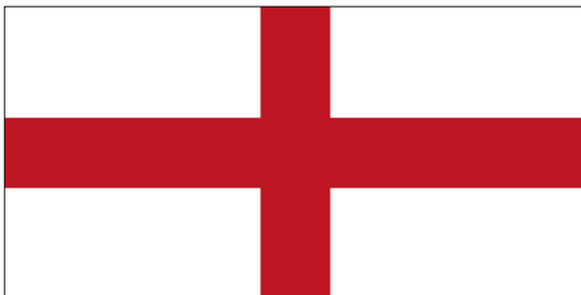
St George's Flag of Genoa

The Monaco Coat of Arms has represented the country for as long as the Grimaldi dynasty has been in power, since the early 15th Century. Although the design has changed gradually over the years, the key elements have remained the same. The motto, 'Deo Juvante' is Latin for 'With God's Help'. This coat of arms today serves as the state flag.