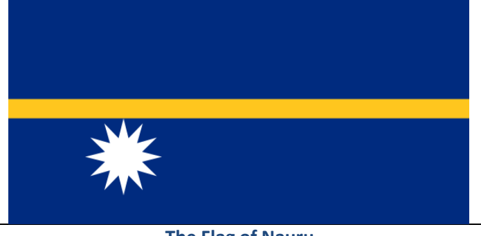
The Flag of Nauru (1968 to Present Day)