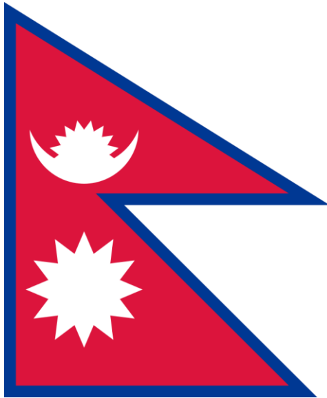
Where In The World