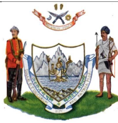
The Coat of Arms of Nepal