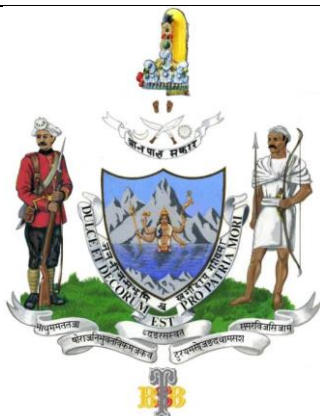
The Coat of Arms of Nepal

The Historical Coats of Arms of Nepal featured a shield depicting the Himalayas and is protected by two Gurkha Soldiers with a royal headdress. The later flag included a white cow and the faced sun and moon.