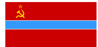
The Flag of the Uzbek SSR