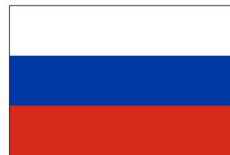
The Flag of Russia (1993 to Present Day)