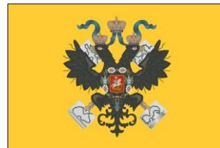
The Imperial Standard of the Tsar (1700 – 1858)

In 1914 the Peter the Great tricolour with the imperial standard in the top left hand corner was also introduced as a private flag for the Tsar.