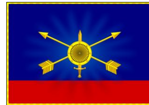
The Flag of the Strategic Rocket Forces