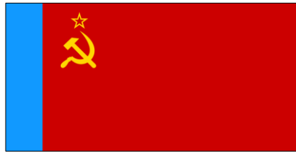
The flag of the Russian SFSR (1954 - 1991)