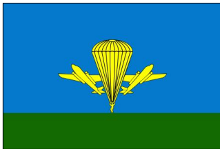
The Flag of the Russian Airborne Troops