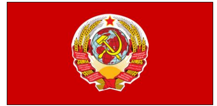
The flag of the Soviet Union (1923)