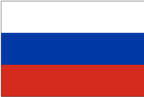
Where In The World