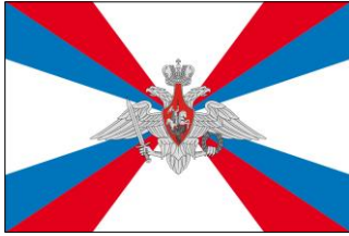
The Flag of the Ministry of Defence

Here are some examples of the military flags of the Russian Federation.