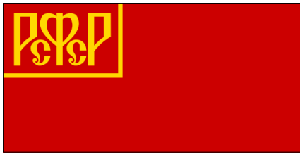
The flag of the Russian SFSR (1918 – 1937)

This was the main symbol for communism until the disintegration of the USSR in 1991.