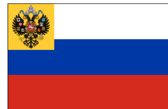
The Unofficial Flag of the Russian Empire (1914 – 1917)