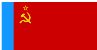
The Flag of the Russian SFSR

During the Soviet rule all the various Republics had flags similar to the Russian one. Here are examples of the flags of the other soviet states under Russia's control. Also included are the flags of autonomous republics that existed in the Soviet Union.