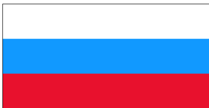
The Flag of the Russian Federation (1991 – 1993)

The anti-Communist 'White movement' used a white, blue, red tricolour during the Russian Civil War and when Russia turned away from Communism in 1991 the new Russian Federation would take the tricolour flag. In 1993 the flag underwent a proportion change.