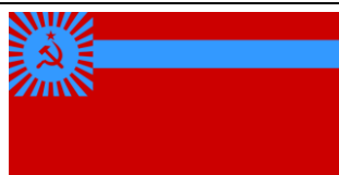
The Flag of the Georgian SSR