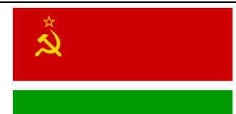
The Flag of the Lithuanian SSR