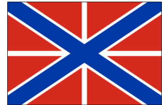
The Jack of the Russian Navy