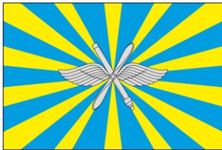
The Flag of the Russian Air Force