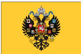
The Imperial Standard of the Tsar (1858 – 1917)

In 1914 the Peter the Great tricolour with the imperial standard in the top left hand corner was also introduced as a private flag for the Tsar.