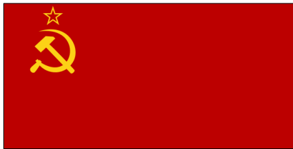
The Flag of the Soviet Union (1923 – 1955)