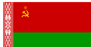
The Flag of the Byelorussian SSR