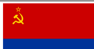
The Flag of Azerbaijan SSR