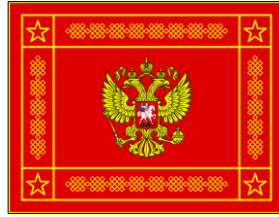
The Flag of the Armed Forces