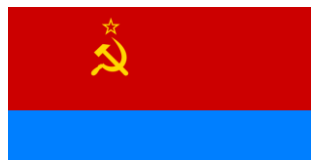
The Flag of the Ukrainian SSR