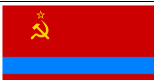
The Flag of the Kazakh SSR