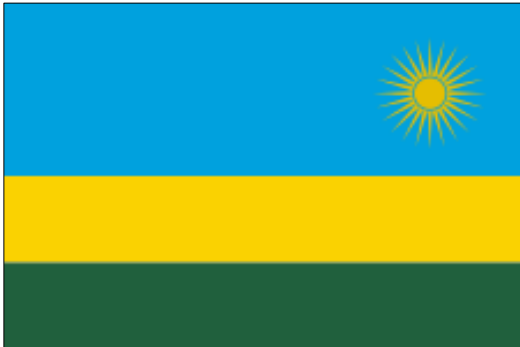
Where In The World