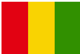
The Flag of the Kingdom of Rwanda (1962)

In 1962 the Kingdom of Rwanda finally gained full independence from Belgium and a red-yellow-green vertical tricolour was adopted. In the same year a large R was placed in the centre of the yellow border.