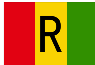
The Flag of Rwanda (1962 – 2001)