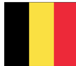
The Flag of Ruanda-Urundi (1916 – 1962)

In 1962 the Kingdom of Rwanda finally gained full independence from Belgium and a red-yellow-green vertical tricolour was adopted. In the same year a large R was placed in the centre of the yellow border.