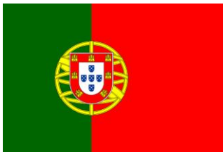
An Example of the Flag of Portugal (1470 – 1975)

Each colour of the flag has a specific meaning, the green represents the land and the lush vegetation of the country, the yellow represents the sun, the red represents the struggle for independence and the two stars represent the two islands.