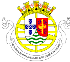
The Coat of Arms of Portuguese São Tomé and Príncipe (1935 – 1951)

Here are some examples of the historical coat of arms of Portuguese São Tomé and Príncipe. They all feature the crowned armillary sphere with a shield containing a water wheel, green wavy lines and the five blue shields with five white circles.