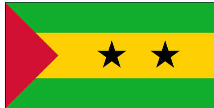
The Flag of São Tomé and Príncipe (1975 to Present Day)