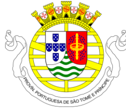
The Coat of Arms of São Tomé and Príncipe (1951 – 1975)