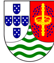
The Lesser Coat of Arms of São Tomé and Príncipe (1935 – 1975)