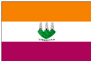
The Old Flag of San Marino (1465)

Not much is known about the original Old Flag of San Marino. It was an orange, white, purple tri-colour with the old emblem showing the three towers of San Marino in the centre. The more modern bicolour appeared in 1797, but it wasn't till 1862 that the Supreme Council of San Marino made it official. The new version of the Coat of Arms was created in 2011 and the flag was altered. Also a Civil flag that doesn't feature the coat of arms is occasionally flown.