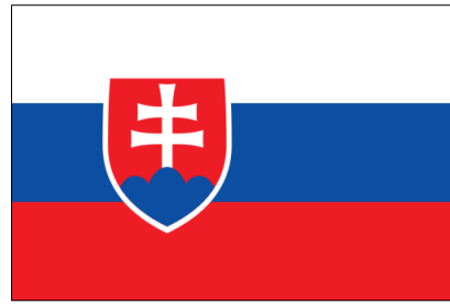
The Flag of Slovakia