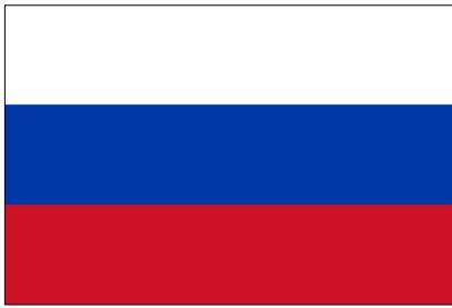
The Flag of the Slovak Republic

In 1992 the current Coat of Arms was added to the flag because without it the flag is identical to the modern Russian flag.