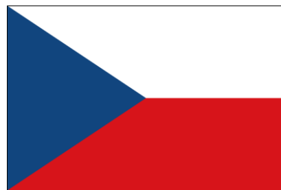
The Flag of Czechoslovakia