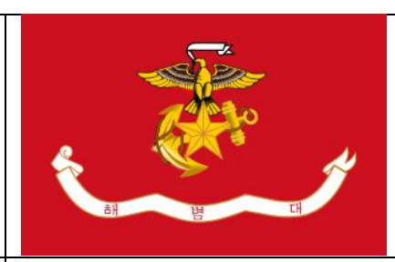
The flag of the Republic of Korea Marine Corps