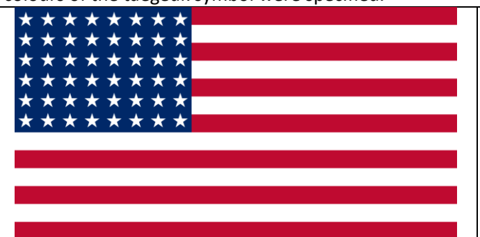
The Flag of the United States of America (1945 – 1948)

The Flag of the United States of America was also flown during this time. In 1948 the trigrams on the flag was written into the constitution. From top right to bottom left they are water, heaven, earth and fire. In 1997 the colours of the taegeuk symbol were specified.