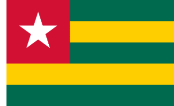
The Flag of Togo (1960 to Present Day)