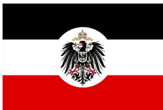
The Flag of the German Togoland Protectorate (1884 – 1914)

In 1916 Britain and the French occupied Togoland and split it up into administrative zones in 1922. The flag in British Togoland was the Blue British Ensign with the emblem of the Gold Coast at the centre right.