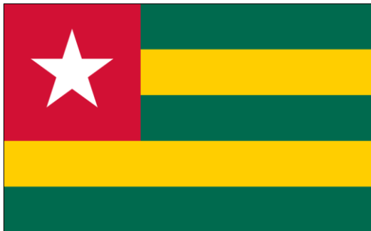
Where In The World