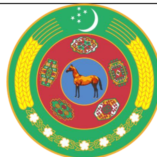
The Emblem of Turkmenistan