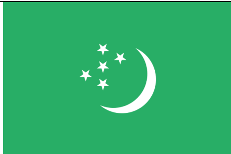
The Flag of the Turkmen Ground Forces

The Roundel of Turkmenistan is a dark-red bordered green disc with white crescent moon and five five-pointed stars at the centre.