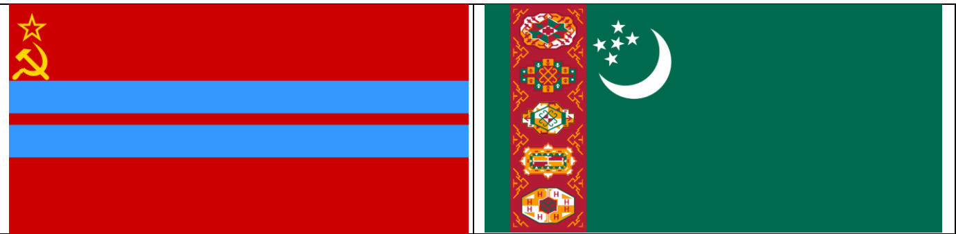
The Flag of Turkmen SSR (1925 – 1991)