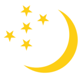
The Flag of the Turkmen Navy