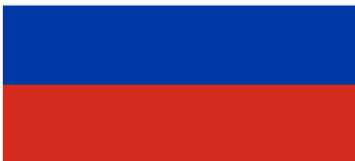
The Flag of Turkestan (1867 – 1918)

In 1818 the area was part of the Russian Soviet Federative Socialist Republic called the Turkestan Autonomous Soviet Socialist Republic. The flag adopted was a plain red field with ACCP in the top left corner.