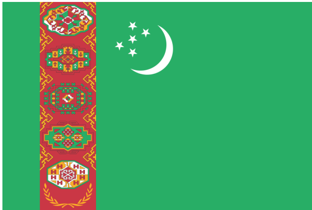
Where In The World