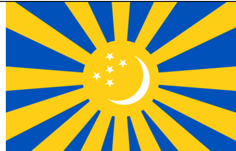
The Flag of the Turkmen Air Force