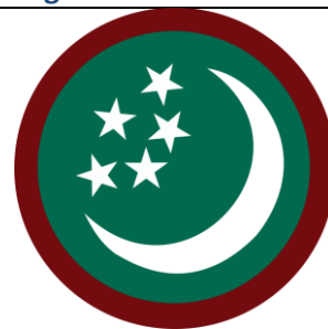
The Roundel of Turkmenistan