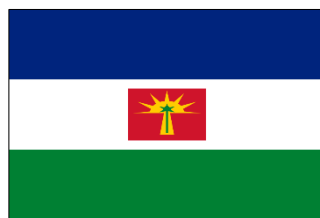
The Flag of Barinas State