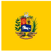
The Presidential Standard of Venezuela

The Presidential Standard of Venezuela features the coat of arms on a yellow field. When at sea the standard is a blue field with a white five-pointed star in each corner.