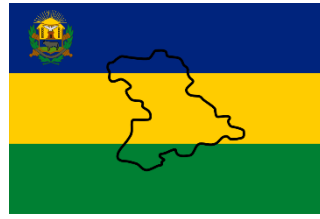
The Flag of Anzoátegui State