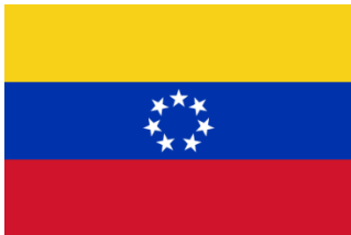
The Flag of Venezuela (1905 – 1930)

In 1905 the star was removed from inside and placed next to the other six stars that create the circle. The seven white five-pointed Stars were positioned into an arch in 1930.