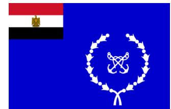
The State / War / Naval Flag of Venezuela (2006 to Present Day)