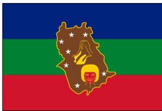
The Flag of Amazonas State

Each state of Venezuela is represented by a different flag. Below are some examples of the flags.