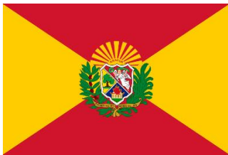
The Flag of Argua State