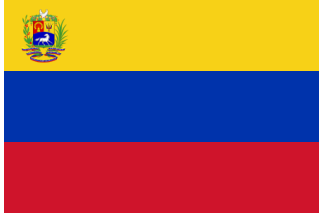
The Flag of Venezuela (1836 -1859)

In 1859 the coat of arms was replaced with seven five-pointed blue stars representing the provinces that made up the nation in 1811.