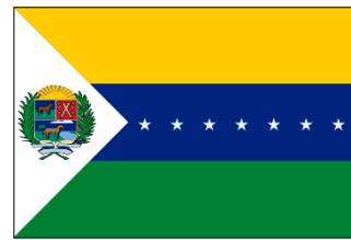
The Flag of Apure State