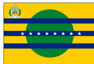
The Flag of Bolívar State