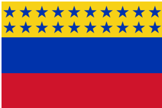
The Flag of Venezuela (1859 – 1863)

In the same year thirteen extra stars were added to the flag to represent all the states of Venezuela. The seven white stars were added back into the flag in 1863, they were placed in a circle with a star in the centre preplaced the previous 20 blue stars.