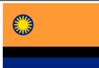
The Flag of Cojedes State