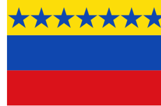
The Flag of Venezuela (1859)

In the same year thirteen extra stars were added to the flag to represent all the states of Venezuela. The seven white stars were added back into the flag in 1863, they were placed in a circle with a star in the centre preplaced the previous 20 blue stars.