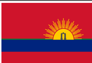
The Flag of Carabobo State