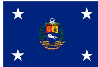
The Presidential Standard of Venezuela at Sea