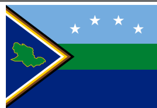
The Flag of Delta Amacuro State