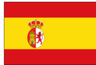
The Flag of the Viceroyalty of New Granada (1717 – 1777) The Flag of the Captaincy General of Venezuela (1777 – 1821)

In 1811 Venezuela claimed independence from Spain to become what is now known as the First Republic of Venezuela. A new 'mother' flag was adopted. It is a yellow-blue-red tricolour with an image of an Indian female holding a lance with Phrygian cap sits on mound looking at a sunset.