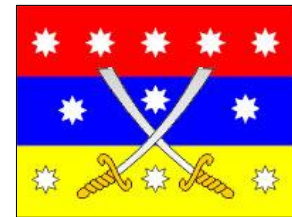
The Flag of the Armenian Kingdom of Cilicia under Lusignan Dynasty (1341 – 1375)