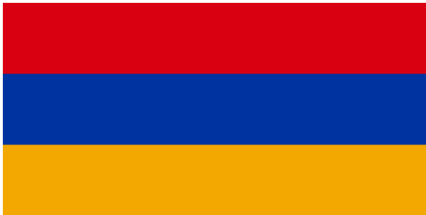
Where In The World