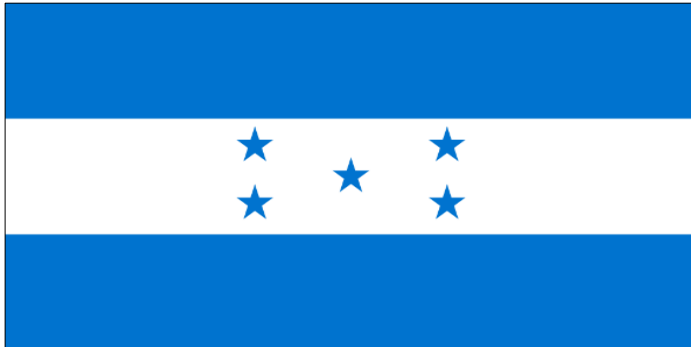
Where In The World