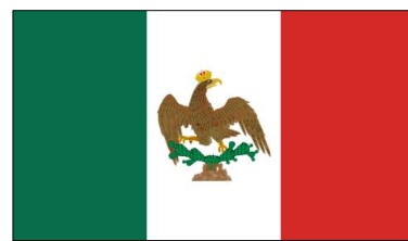
The Flag of the First Mexican Empire (1821 – 1823)

The First Mexican Empire was replaced with The Federal Republic of Central America in 1823. The flag was changed to a blue-white-blue horizontal triband with the Republic coat of arms at the centre.