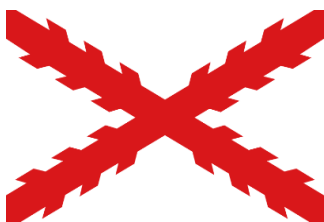
The Flag of the Viceroy of New Spain (1535–1821)

In 1821 the Spanish lost control and Honduras became part of the First Mexican Empire. The green-white-red vertical tricolour with coat of arms of Mexico at the centre was adopted.