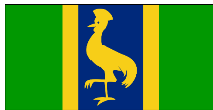
The Flag of Uganda (1962)

The green flag was short lived as the new flag was adopted in the same year. The new flag featured 2 black, 2 yellow, 2 red horizontal stripes with a white circle in the centre that featured a grey crowned crane.