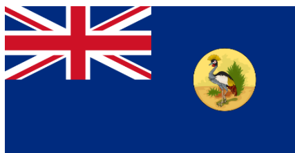
The Flag of the British Protectorate of Uganda (1894 – 1962)

When Uganda gained independence in 1962 a new flag was adopted. It featured a plain green field with a yellow-bordered blue vertical stripe at the centre. Inside the blue stripe is a Gold silhouette of the grey crowned crane.