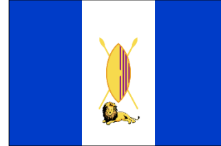
The Flag of Buganda