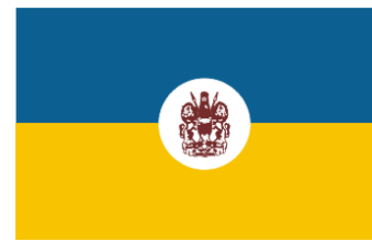
The Flag of Toro