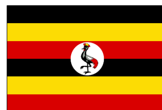
The Flag of Uganda (1962 to Present Day)

Each element of the flag has a specific meaning. Black colour represents the African people, yellow colour represents sunshine, red colour represents the blood of the people and the grey crowned crane represents the gentle nature of the people.